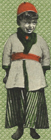
This smile is surely worth while

AT LEAST 2,144,000 DESTITUTE SURVIVORS, OF WHOM 400,000 ARE ORPHANS